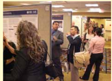
The poster hall at the conference was very busy and well-attended.