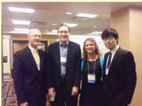
Dental PBRN colleagues in the poster hall